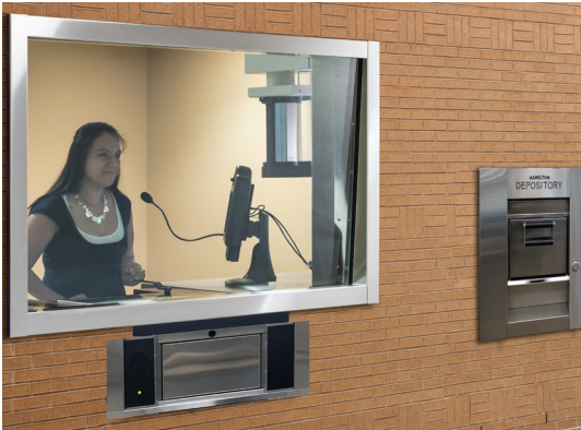
3' x 5' Window

Windows pair easily with Hamilton's Transaction Drawers. The drawer and window are designed to be used together, but can be installed separately to replace existing equipment in both drive-thru and walk-up applications.